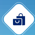
PLASTIC & CLOTH BAGS